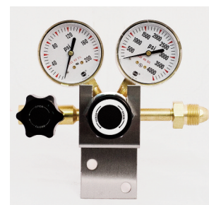
EZ3100 Bracket (see page 91).