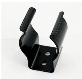
8012C Mounting Clip

Gas traps should be mounted in a vertical position to ensure proper contact of the gas with the adsorbent. Use model 8012C mounting clip with 8200 Series hydrocarbon trap.