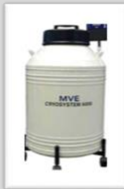
MVE Cryosystem 6000 w/Full Auto Roller Base & Transfer Hose Model #14797765 Normally $8,212 Discounted to $6,675