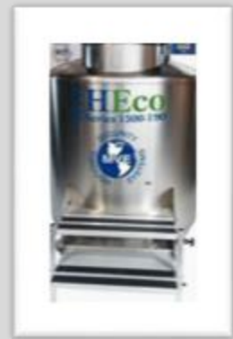
MVE HEco™ 1500 Series Freezer 1536P-190AF-GB-BB Model #20884101 Normally $31,810 Discounted to $27,833

If Validation & LN2 Savings are Important to you, Step Up to the Technology of the MVE HEco Freezer line.