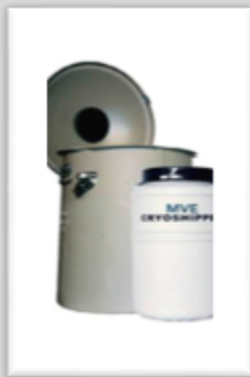
MVE Cryoshipper with Shipping Container included Model #20925284 Normally $3,255 Discounted to $2,645

Middlesex Gases & Technologies is a distributor for Chart Industries cryostorage equipment. Chart is well known as an industry leader who provides high quality, reliable equipment. The units feature a four-thermistor based controller that is especially user-friendly. The low maintenance, all stainless steel construction and large neck opening provide a durable environment for your biological samples. For a short time, Middlesex Gases is offering three of our best-selling systems to you at a great savings. These systems provide the consistency required when dealing with critical samples.